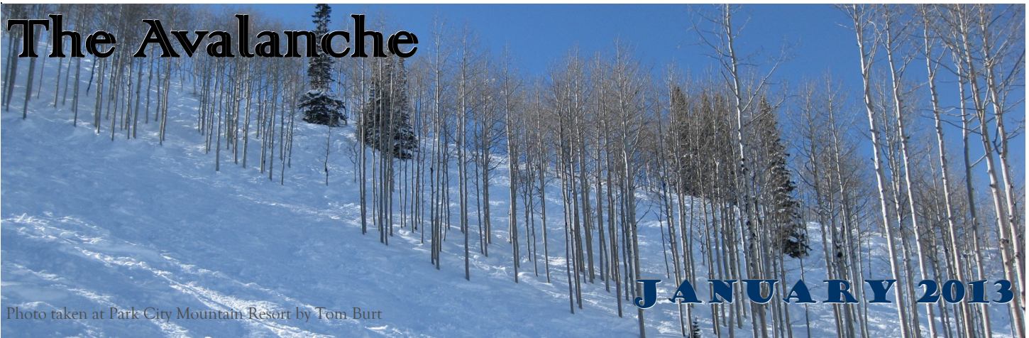
Photo taken at Park City Mountain Resort