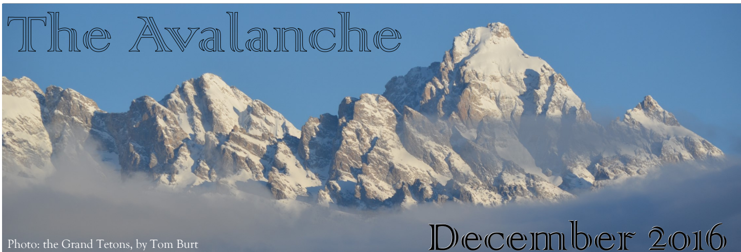
Photo: the Grand Tetons